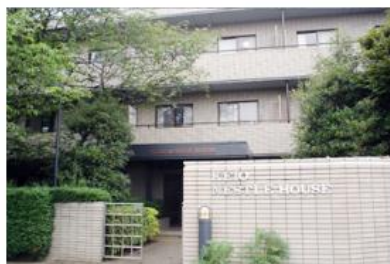
Accommodation for International Faculty and Scholars