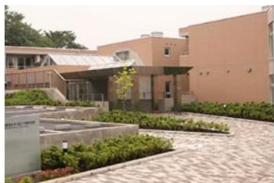
Housing for International Students